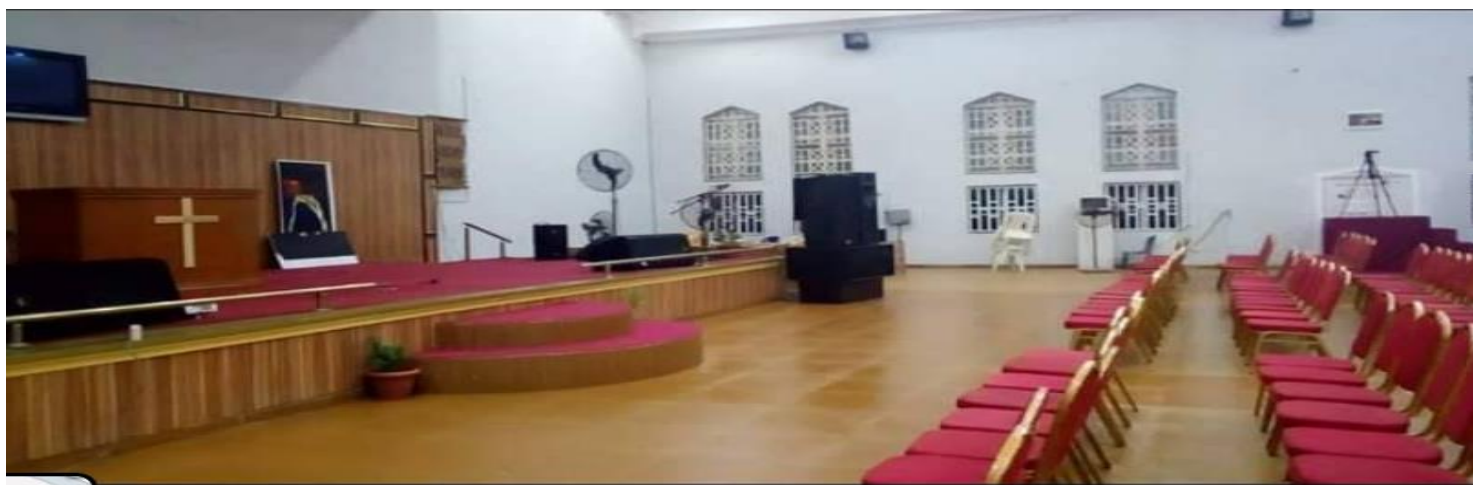
RAPTURE TIME CHRISTIAN ASSEMBLY CHURCH AUDITORIUM